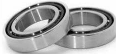
B71900-2RZ Ultra high-speed Sealed angular contact ball bearings (ISO19)

B71900 C-2RZ = 15° Contact Angle B71900 AC-2RZ = 25° Contact Angle